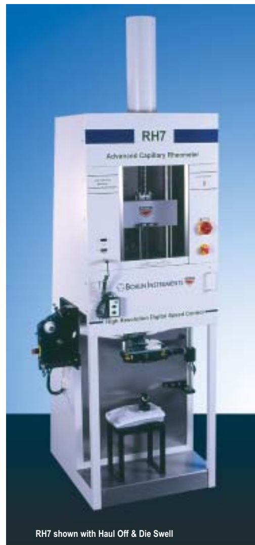
RH7 shown with Haul Off & Die Swell

The floor standing design affords the rheometers with an open architecture below the barrel and heater assembly. This space can be used to accommodate other experimental options such as die swell measurement, a slot die, haul-off (melt strength) and a haul-off (post-extrusion) oven.