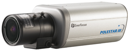
EQ 610 s – 8,5mm (1/3") day/night camera with D-WDR, high resolution, automatic IR cut filter