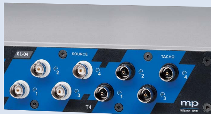
High-precision 24-bit D/A converter

or the test equipment. This automatic, analog shutdown circuitry guarantees the highest safety possible during the test.