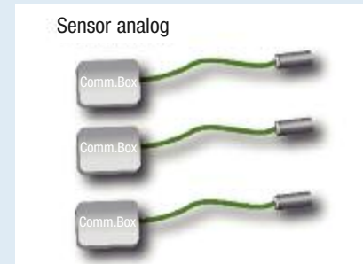
Conventional analog sensors require one box for one sensing head.