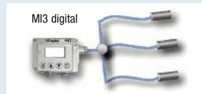
Multiple sensing head design for the digital MI3 saves installation costs.