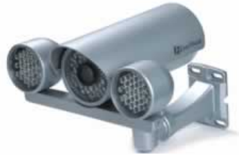
Image: EZ 550 with additional IR illuminator kit EIR 100

Wave length: 850 nm Beaming angle: 30° each (total 30~90° adjustable incl. camera) Colour: silver Protection class: IP 66 Power source: 12 V DC, through EZ 650 power output Power consumption: 17 W max. Ambient temperature: -40°C ~ +50°C Dimensions (HxWxD): 105 x 130 x 200 mm Weight: 750 g Application: with EZ 650 and EZN 850