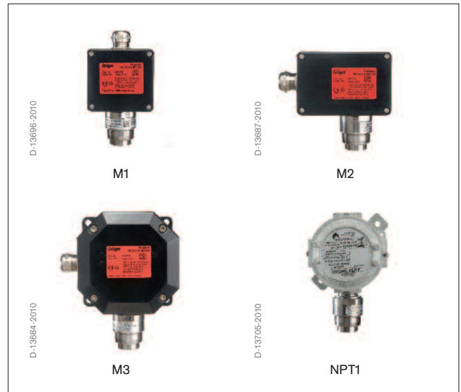
Dräger Polytron SE Ex LC ... DD