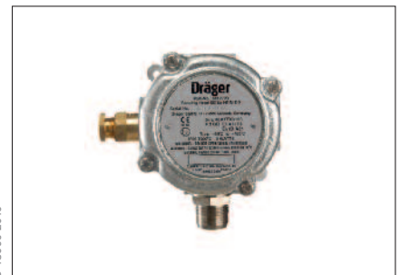
Dräger Polytron SE Ex HT M DD

The sensing head Polytron SE Ex HT M DD (HT = High Temperature) is intended to be used at ambient temperatures up to 150 °C. This sensing head is preferably used in applications where extremely high temperatures can occur, especially for leak detection in the direct vicinity of gas turbines. The temperature resistant terminals are housed in a robust galvanized cast iron enclosure.