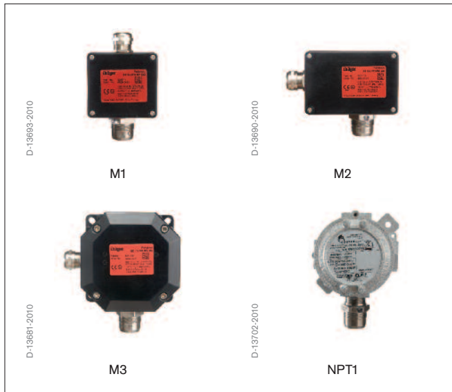
Dräger Polytron SE Ex PR ... DD