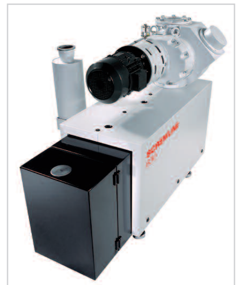
SCREWLINE SP 630 vacuum system with Roots pump (2000 m 3 /h)