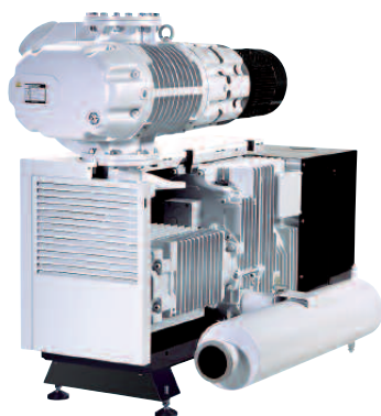
Arrangement of all maintenance locations and controls on one side

The pump chamber may be cleaned from process deposits with the optional purge kit if necessary.