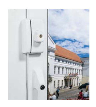
Active protection with FTS 96 E radio window security