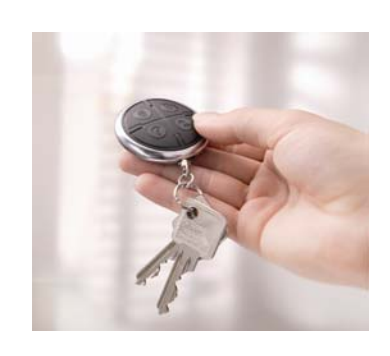
Bidirectional radio remote control