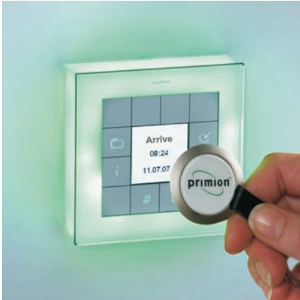
DT 200 with polished glass surface and sensory keypad